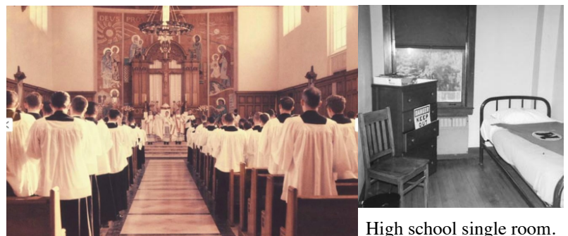
High school single room.