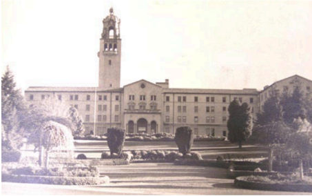
A 1948 photo of St. Joe's without the college wing and the tower top was different. BELOW the courtyard after mass or Vespers, and then the well traversed trail to Maryknoll which still stands and is used as a retirement center for Maryknoll priests.

Home Intro Bio Links Photos: Pg1, Pg2, P3 2008 REUNION 2017 Fifty Year Reunion 2015 Mini-Reunion Reflections