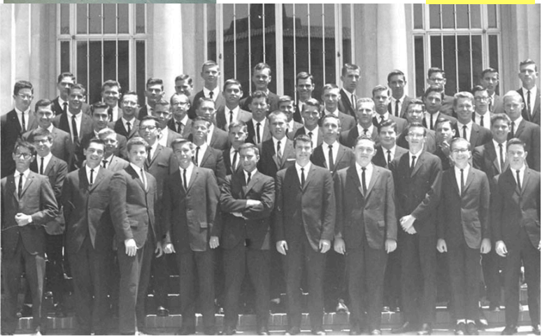
4th High class on the chapel steps before graduation. Still two more years of college there at St. Joseph's College.

ALL PHOTOS CAN BE ENLARGED WHEN VIEWED IN A PDF VIEWER.