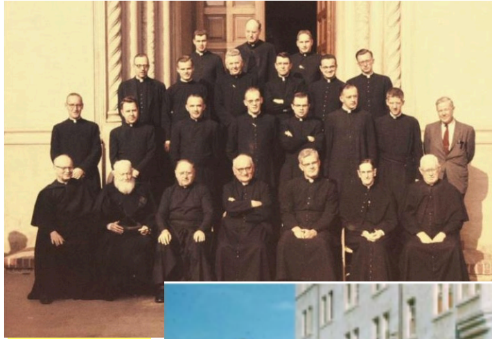
The faculty one or two years before we arrived in 1961. See how many you can identify. Below students visit between classes on the high school side of the building.

ALL PHOTOS CAN BE ENLARGED WHEN VIEWED IN A PDF VIEWER.