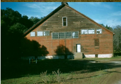
The Barn where the high school played basketball and broom hockey, the chapel in the college wing, and a room on the high school side.