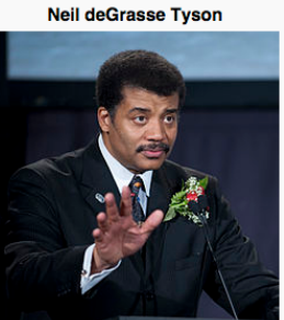
but of Apollo 11 at the National Air and Space Museum in Washington, July 2009

may not be for everyone, only those interested in science, its methods, and his life. He is surrounded by some of the most talented people on the Tyson hosting the 40th anniversary celebration planet, sounds at