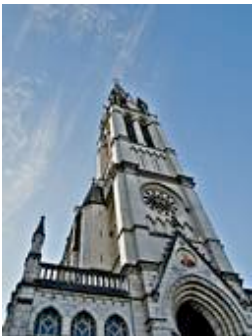
Cathedral at Fatima

As such, persons and/or places ( Lourdes in France, Fatima in Portugal, Medjugorje in Bosnia, Guadalupe in Mexico, plus non-Christian sites worldwide) who and which inspire the faithful to heal in mind, body, and/or spirit, can be very