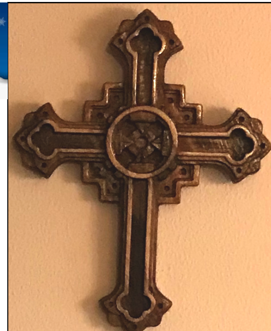
A cross designed by David using a CNC router.

Below are two some short videos you might want to look at below and a link for a free multiplication app (sans artwork)